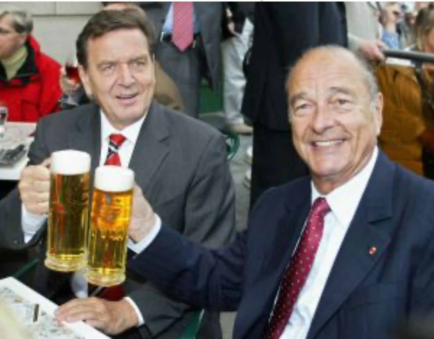
2003-2023: Futurometer Timeline